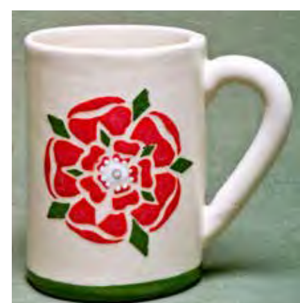
5120 Mug, 4.5 x 3 x 4.5"