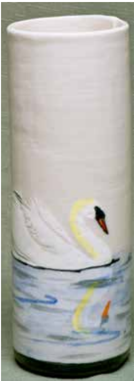
4050 Vase, 3.5 x 9"

A symbol of elegance, grace, and poise, this gorgeous swan has long since shed its humble beginnings in the duck pond.