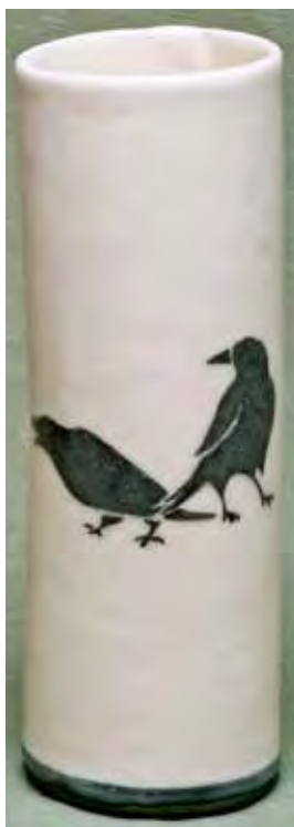
4050 Vase, 3.5 x 9"

Easy-going, industrious, couple of crows to delight your customers!