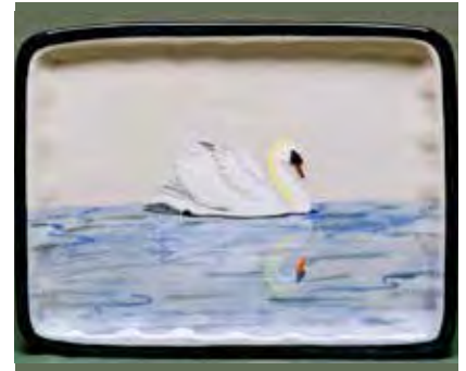
5451 Plate, 8.25 x 11 x .5"