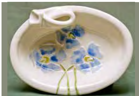
5461 Plate, 7.25 x 4.5 x 1.5", plate knife