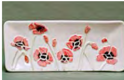
5535 Rectangle dish, 10 x 4"