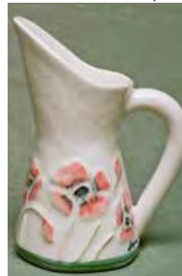
5195 Pitcher, creamer, 4.5 x 3.25 x 6"