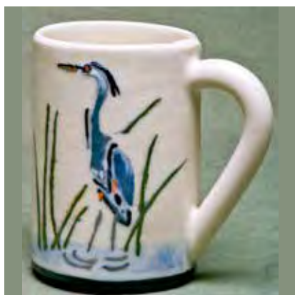
5120 Mug, 4.5 x 4.5 x 3"

The Great Blue Heron evokes memories of the lakes, marshes and waterways of our great Country.