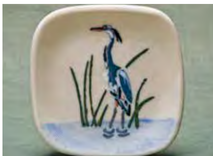
5534 Tea Bag Holder, 3.5 x 3.5"