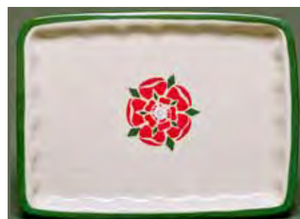
5451 Plate, 8.25 x 11 x .5"