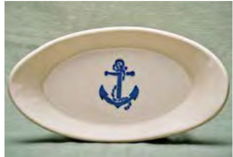
5067 Oval Baker, 8.5 x 4.5 x .5"