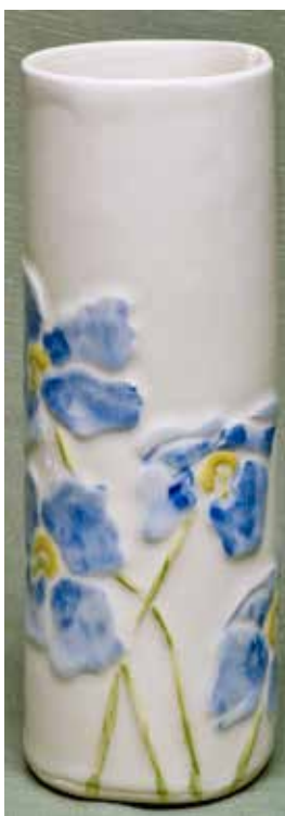
4050 Vase, 3.5 x 9"