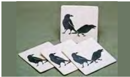
9410 Coaster Set, 4 x 4"