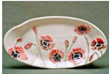
5067 Oval Baker, 8.5 x 4.5 x .5"