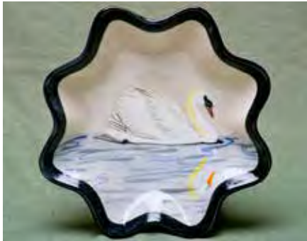
5517 Fluted Bowl, 7.75 x 7.75 x 1"