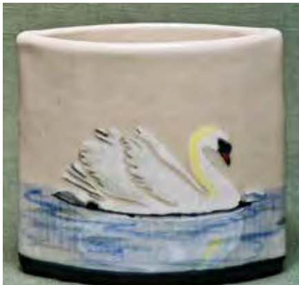
9240 Vase/Holder, 4.5 x 2.5 x 4.5"