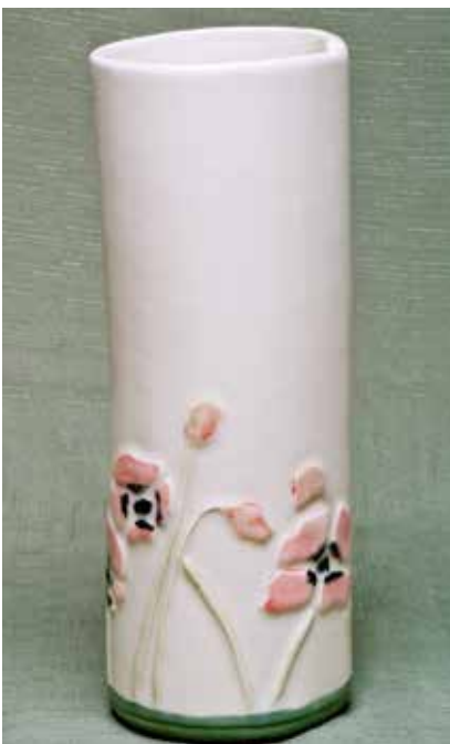
4050 Vase 3.5 x 9"

Poppies are a prominent feature of "In Flanders Fields" by Canadian Lieutenant Colonel John McCrae, one of the most frequently quoted English-language poems composed during the First World War.