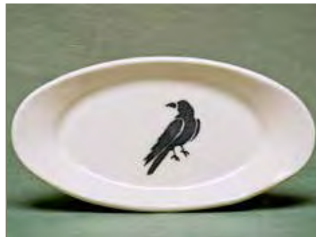
5067 Oval Baker, 8.5 x 4.5 x .5"