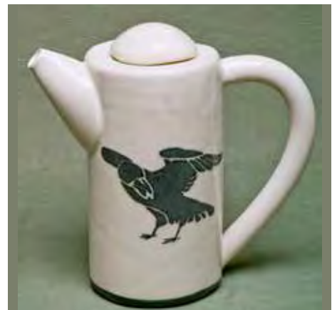
5184 Teapot, 7.5 x 3.5 x 9.25"