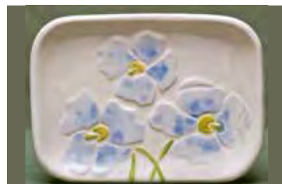
9220 Soap Dish, 3.5 x 5"