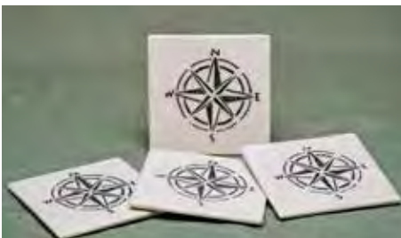
9410 Coaster Set, 4 x 4"