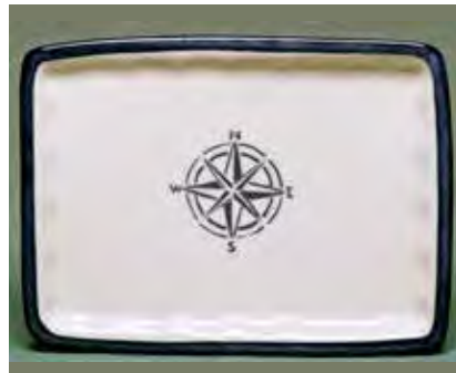
5451 Plate, 8.25 x 11 x .5"