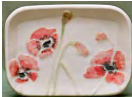
9220 Soap Dish, 3.5 x 5"