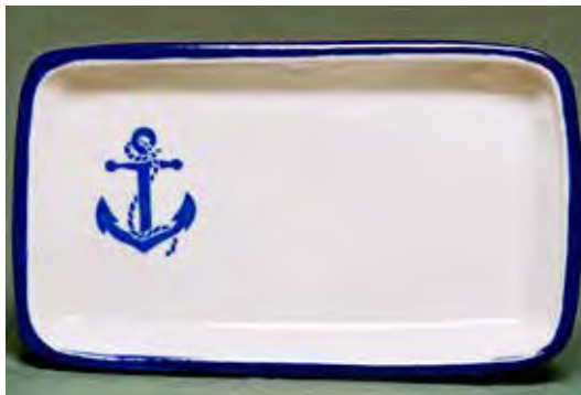
5449 Plate, 14 x 8 x 1"