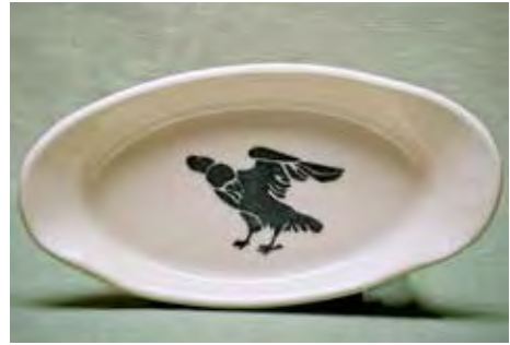
5067 Oval Baker, 8.5 x 4.5 x .5"