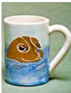
5120 Mug, 4.5 x 4.5 x 3"