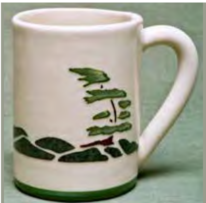
5120 Mug, 4.5 x 3 x 4.5"

Feel the wind on your face... The natural beauty of the windswept pine evokes the rocky, rugged shores of Canada's many lakes.