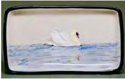
5449 Plate, 14 x 8 x 1"