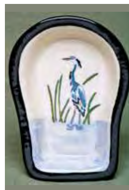
5052 Spoon Rest, 6.25 x 4 x 1"