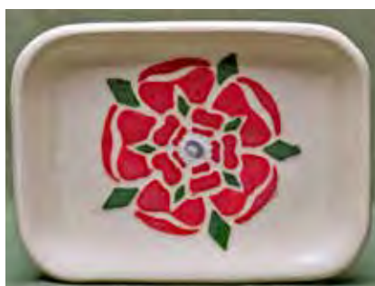
9220 Soap Dish, 3.5 x 5"