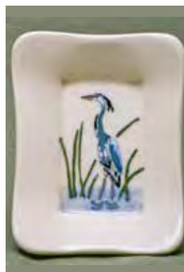
5065 Dish, 5 x 3.75 x 1"