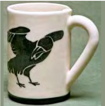
5120 Mug, 4.5 x 3 x 4.5"