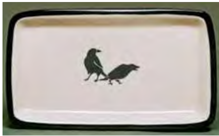
5449 Plate, 14 x 8 x 1"