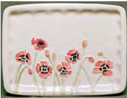
5451 Plate, 8.25 x 11 x .5"