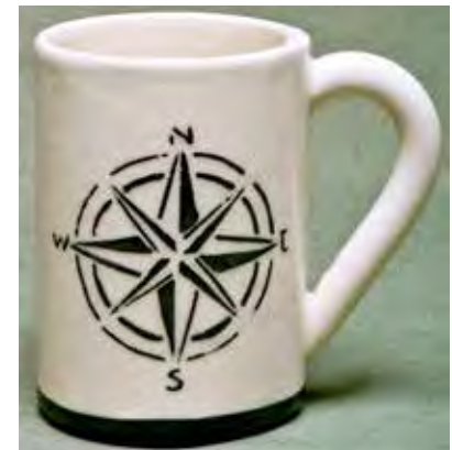
5120 Mug, 4.5 x 3 x 4.5"