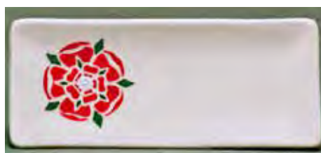
5535 Rectangle dish, 10 x 4"

The migration of British Loyalists to many parts of Canada is commemorated by this bold depiction of the Loyalist Rose.