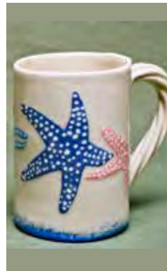
5120 Mug, 4.5 x 3 x 4.5"