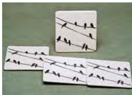
9410 Coaster Set, 4 x 4"