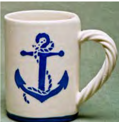
5120 Mug, 4.5 x 3 x 4.5"