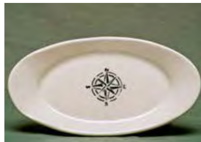
5065 Dish, 5 x 3.75 x 1"

Also known as the Windrose, it will point you to the right decor decisions.