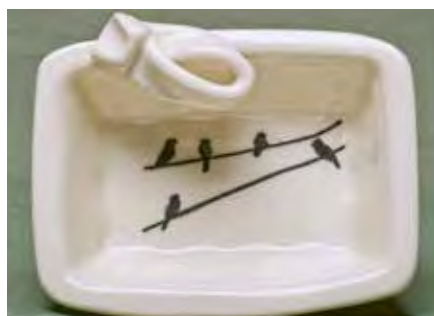
5463 Pate, 6.25 x 4.75 x 1.75", pate knife