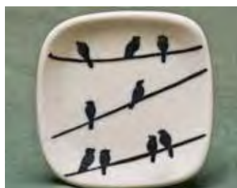
5534 Tea Bag Holder, 3.5 x 3.5"

The collective noun for this loud, rambunctious and very intelligent bird seems rather dire indeed!