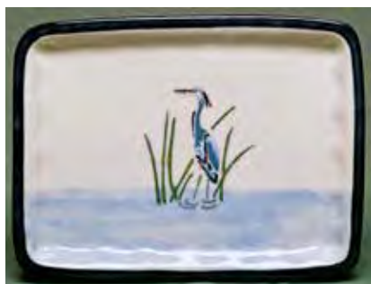
5451 Plate, 8.25 x 11 x .5"