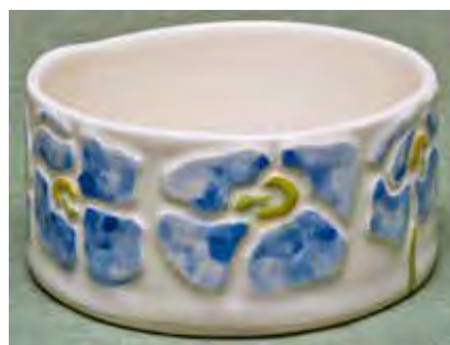
5004 Wine Coaster/Brie Baker, 4.5 x 2"