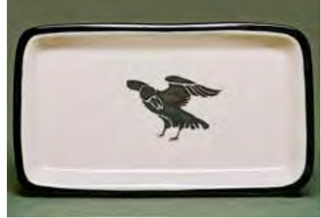
5449 Plate, 14 x 8 x 1"