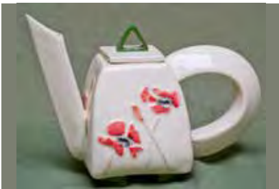
5188 Teapot, 9 x 4 x 6"