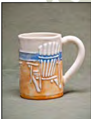
At the Lake