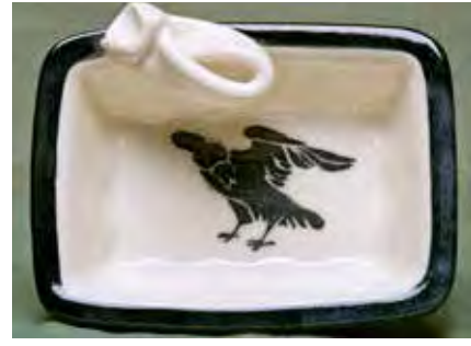
5463 Plate, 6.25 x 4.75 x 1.75", plate knife