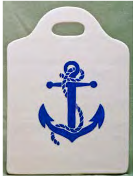
5440 Cheeseboard, 12.25 x 9 x .25", plate knife, boxed