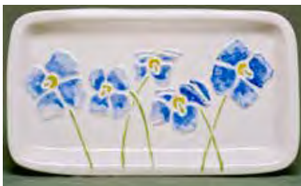
5449 Plate, 14 x 8 x 1"