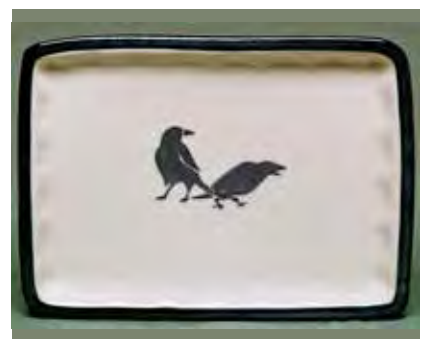
5451 Plate, 8.25 x 11 x .5"