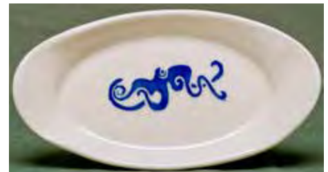
5067 Oval Baker, 8.5 x 4.5 x .5"