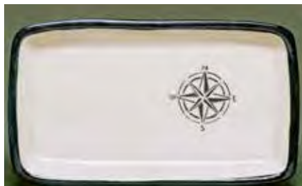
5449 Plate, 14 x 8 x 1"