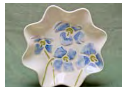
5517 Fluted Bowl, 7.75 x 7.75 x 1"