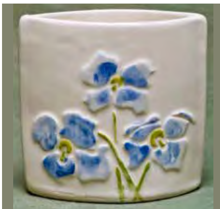
9240 Vase/Holder, 4.5 x 2.5 x 4.5"

The enchanting Blue Poppy creates a spectacular show in the late spring and early summer. Such a rich, true blue flower is a rare garden treasure.