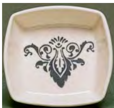
5533 Bowl, Rimless, 5.5 x 5.5 x 1.75"