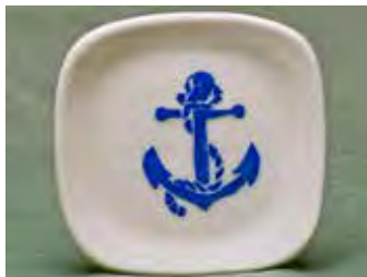
5534 Tea Bag Holder, 3.5 x 3.5"