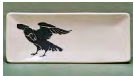
5535 Rectangle dish, 10 x 4"

Noisy and gregarious, crows are a symbol of good luck!