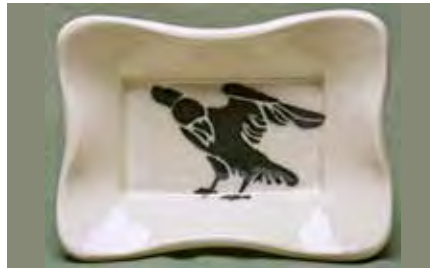
5065 Dish, 5 x 3.75 x 1"