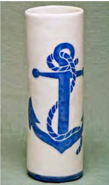
4050 Vase 3.5 x 9"

Ground your nautical theme with our classic Anchor pattern.