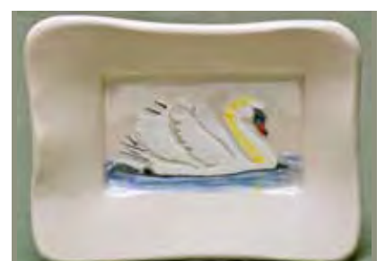
5065 Dish, 5 x 3.75 x 1"

A symbol of elegance, grace, and poise, this gorgeous swan has long since shed its humble beginnings in the duck pond.