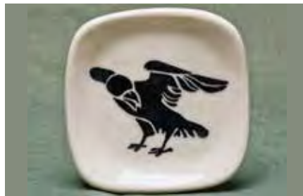
5534 Tea Bag Holder, 3.5 x 3.5"