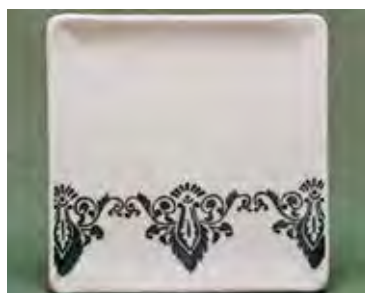
5530 Dinner Plate, 8 x 8