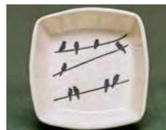
5533 Bowl, Rimless, 5.5 x 5.5 x 1.75"

The collective noun for this loud, rambunctious and very intelligent bird seems rather dire indeed!