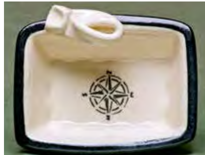
5463 Pate, 6.25 x 4.75 x 1.75", pate knife