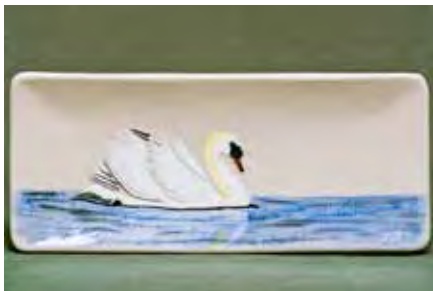
5535 Rectangle dish, 10 x 4"