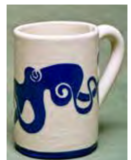
5120 Mug, 4.5 x 3 x 4.5"