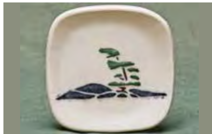
5534 Tea Bag Holder, 3.5 x 3.5"

Feel the wind on your face... The natural beauty of the windswept pine evokes the rocky, rugged shores of Canada's many lakes.