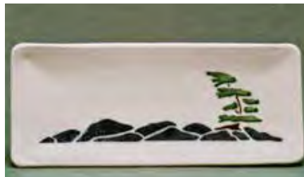
5535 Rectangle dish, 10 x 4"