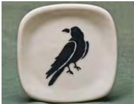
5534 Tea Bag Holder, 3.5 x 3.5"