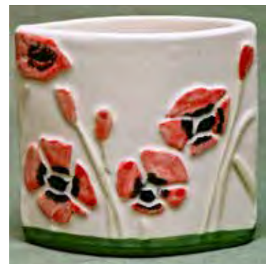
9240 Vase/Holder, 4.5 x 2.5 x 4.5"