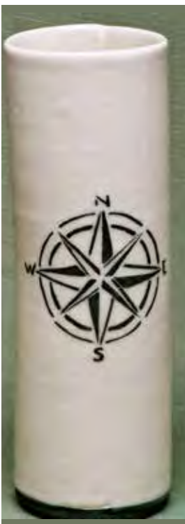
4050 Vase, 3.5 x 9"