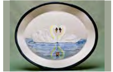
5005 Platter, oval, 15 x 12.5 x 1"