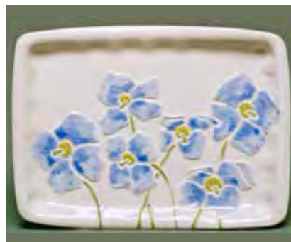
5451 Plate, 8.25 x 11 x .5"