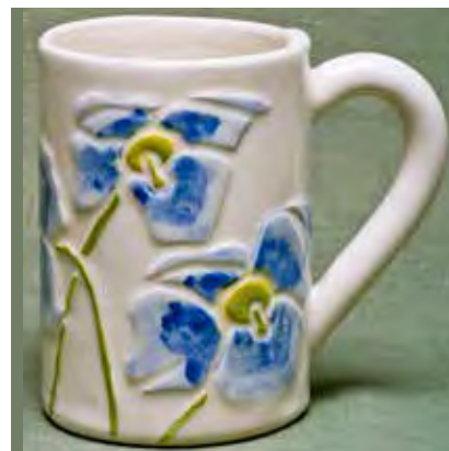
5120 Mug, 4.5 x 3 x 4.5"

The enchanting Blue Poppy creates a spectacular show in the late spring and early summer. Such a rich, true blue flower is a rare garden treasure.