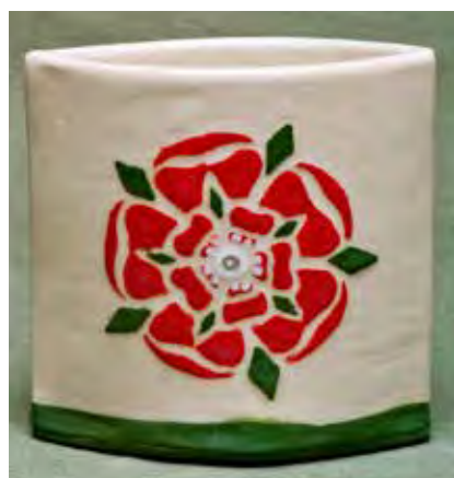
9240 Vase/Holder, 4.5 x 2.5 x 4.5"

The migration of British Loyalists to many parts of Canada is commemorated by this bold depiction of the Loyalist Rose.