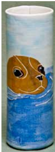
4050 Vase 3.5 x 9"