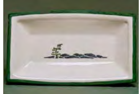
5062 Rectangle dish, 12.5 x 7.5 x 1.75"