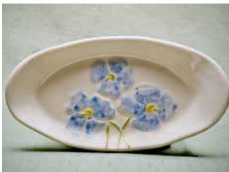
5067 Oval Baker, 8.5 x 4.5 x .5"