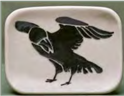
9220 Soap Dish, 3.5 x 5"