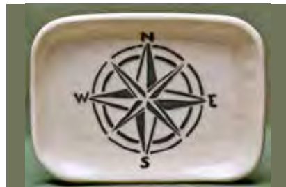
9220 Soap Dish, 3.5 x 5"