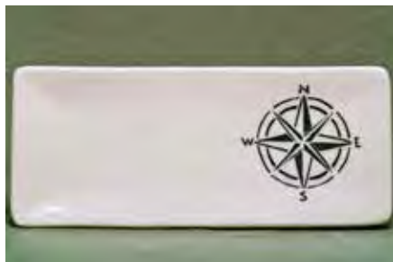
5535 Rectangle dish, 10 x 4"