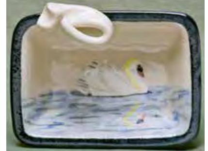
5463 Pate, 6.25 x 4.75 x 1.75", pate knife