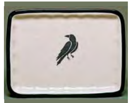
5451 Plate, 8.25 x 11 x .5"