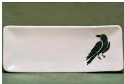
5535 Rectangle dish, 10 x 4"