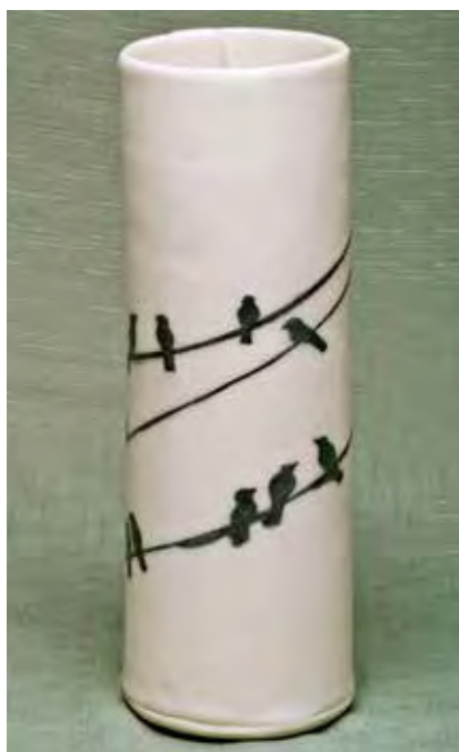
4050 Vase 3.5 x 9"