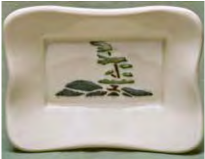
5065 Dish, 5 x 3.75 x 1"