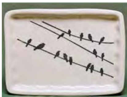
5451 Plate, 8.25 x 11 x .5"