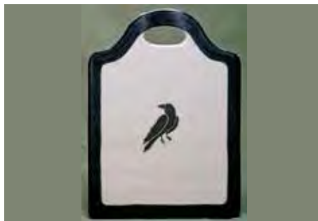
5440 Cheeseboard, 12.25 x 9 x .25", pate knife, boxed