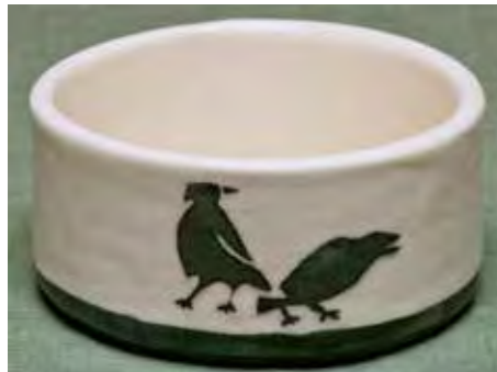
5004 Wine Coaster/Brie Baker, 4.5 x 2"