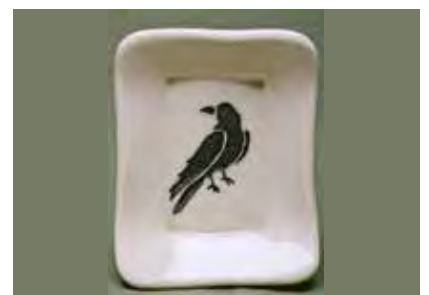
5065 Dish, 5 x 3.75 x 1"

The sleek silhouette of the common crow makes a stunning image when captured on nature's clay.