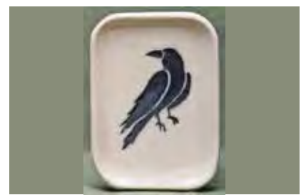
9220 Soap Dish, 3.5 x 5"