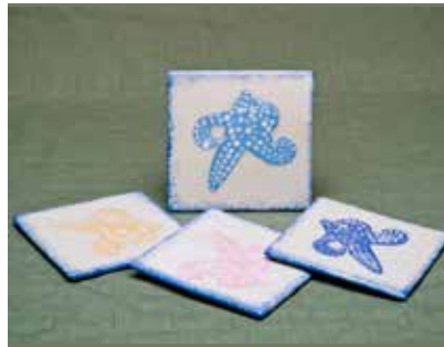
9410 Coaster Set, 4 x 4"