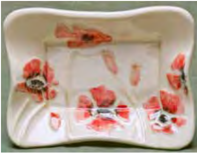
5065 Dish, 5 x 3.75 x 1"