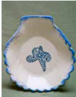
5513 Dish, Scallop, 6 x 6.5 x 1"

The story of the Star Fish Thrower stirs us all to make a difference.