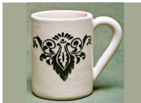
5120 Mug, 4.5 x 3 x 4.5"

An elegant pattern, in timeless black and white, to grace any dining table.