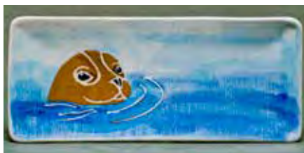
5535 Rectangle dish, 10 x 4"