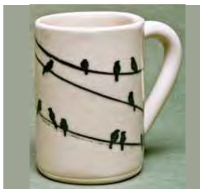
5120 Mug, 4.5 x 3 x 4.5"