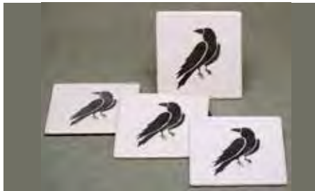
9410 Coaster Set, 4 x 4"