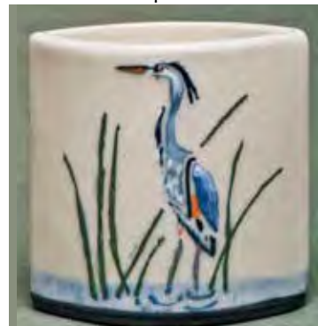
9240 Vase/Holder, 4.5 x 2.5 x 4.5"