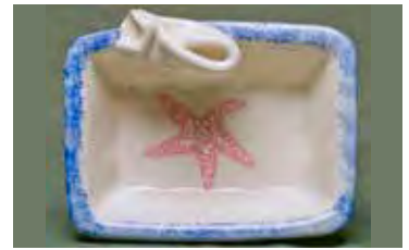
5463 Pate, 6.25 x 4.75 x 1.75", pate knife