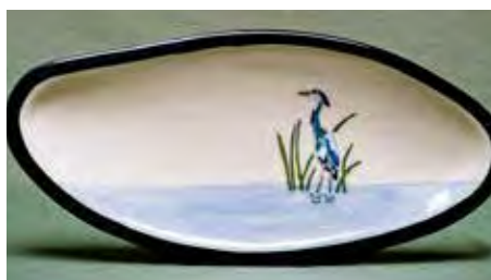
5050 Candy Dish, 11.5 x 5.75 x 1"

The Great Blue Heron evokes memories of the lakes, marshes and waterways of our great Country.