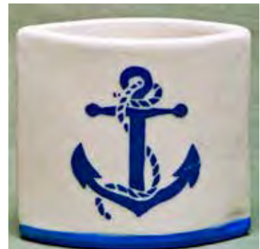
9240 Vase/Holder, 4.5 x 2.5 x 4.5"