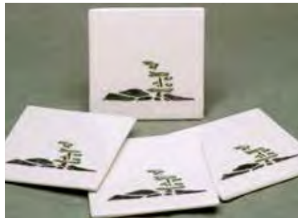
9410 Coaster Set, 4 x 4"