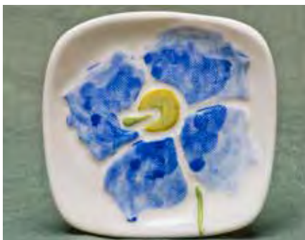
5534 Tea Bag Holder, 3.5 x 3.5"