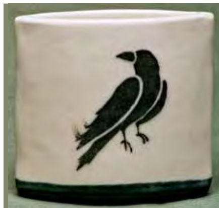
9240 Vase/Holder, 4.5 x 2.5 x 4.5"