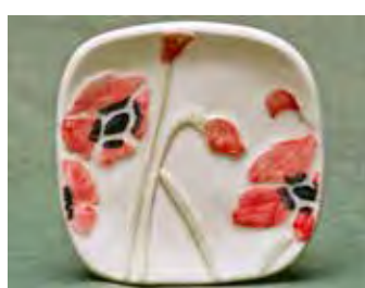
5534 Tea Bag Holder, 3.5 x 3.5"