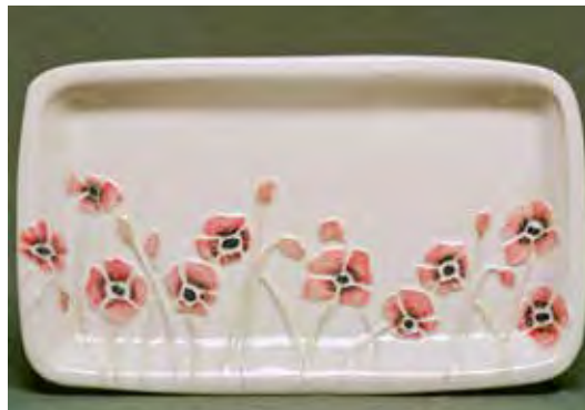
5449 Plate, 14 x 8 x 1"