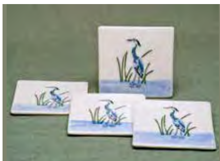
9410 Coaster Set, 4 x 4"