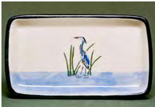
5449 Plate, 14 x 8 x 1"