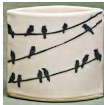
9240 Vase/Holder, 4.5 x 2.5 x 4.5"