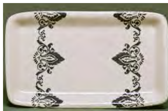
5449 Plate, 14 x 8 x 1"