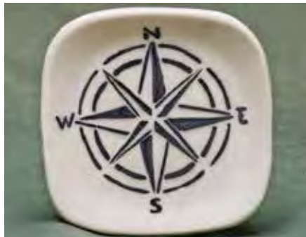
5534 Tea Bag Holder, 3.5 x 3.5"