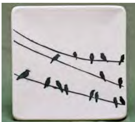
5532 Luncheon Plate, 6.25 x 6.25"