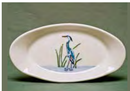
5067 Oval Baker, 8.5 x 4.5 x .5"