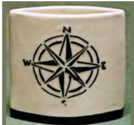
9240 Vase/Holder, 4.5 x 2.5 x 4.5"