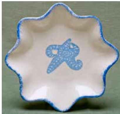
5517 Fluted Bowl, 7.75 x 7.75 x 1"