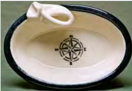
5461 Pate, 7.25 x 4.5 x 1.5", pate knife