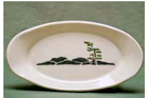
5067 Oval Baker, 8.5 x 4.5 x .5"