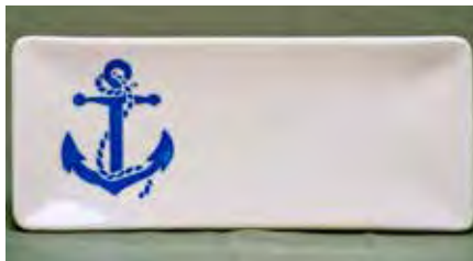
5535 Rectangle dish, 10 x 4"

Ground your nautical theme with our classic Anchor pattern.