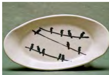
5067 Oval Baker, 8.5 x 4.5 x .5"