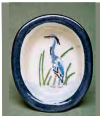
5468 Pickle Dish, 4.75 x 4 x 1"