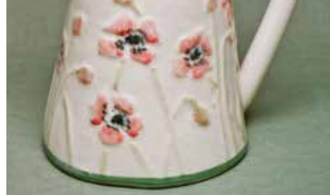
5196 Pitcher, 8 x 6 x 11.5"

Poppies are a prominent feature of "In Flanders Fields" by Canadian Lieutenant Colonel John McCrae, one of the most frequently quoted English-language poems composed during the First World War.