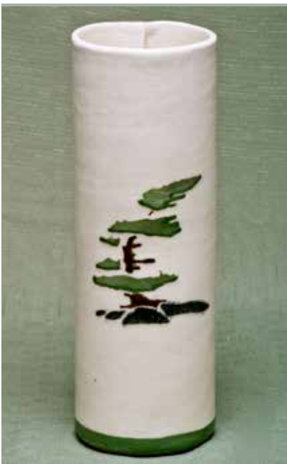
4050 Vase 3.5 x 9"