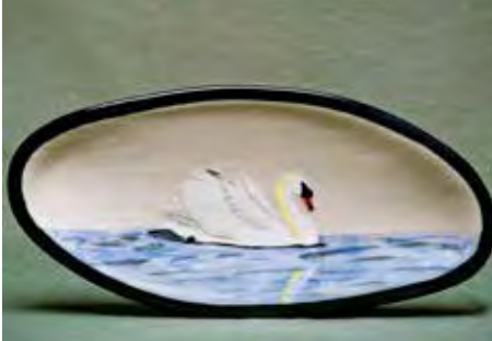
5050 Candy Dish, 11.5 x 5.75 x 1"