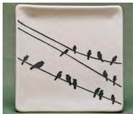
5530 Dinner Plate, 8 x 8