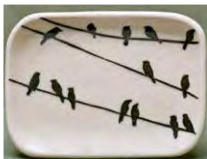
9220 Soap Dish, 3.5 x 5"