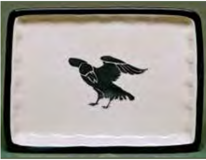
5451 Plate, 8.25 x 11 x .5"