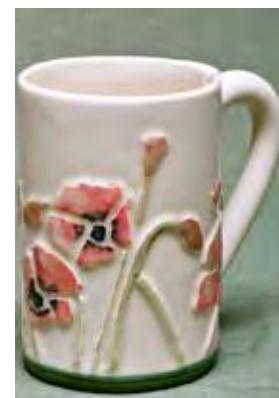
5120 Mug, 4.5 x 3 x 4.5"