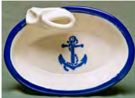
5461 Plate, 7.25 x 4.5 x 1.5", plate knife