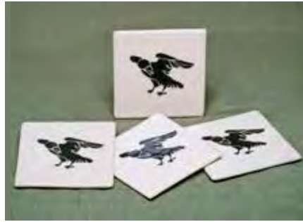
9410 Coaster Set, 4 x 4"