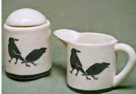
5145 Cream & Sugar Set