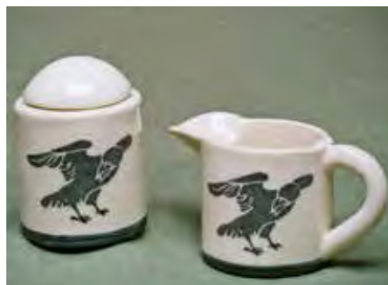
5145 Cream & Sugar Set