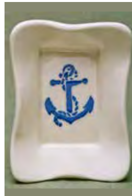
5065 Dish, 5 x 3.75 x 1"