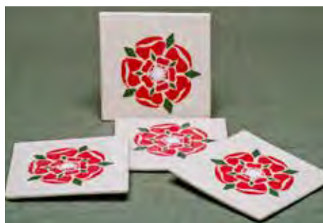
9410 Coaster Set, 4 x 4"