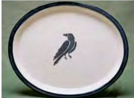
5106 Plate, 10.25 x 8.5 x .75"