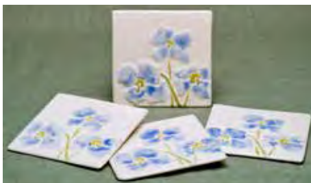
9410 Coaster Set, 4 x 4"