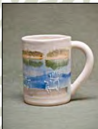
Sitting on Dock