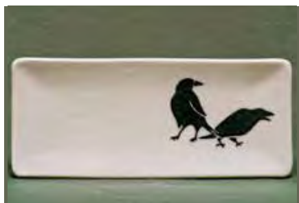
5535 Rectangle dish, 10 x 4"