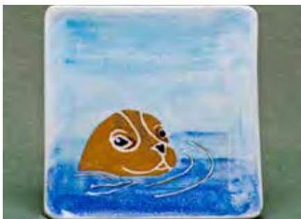
5532 Luncheon Plate, 6.25 x 6.25"