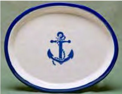
5106 Plate, 10.25 x 8.5 x .75"