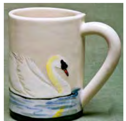
5120 Mug, 4.5 x 3 x 4.5"