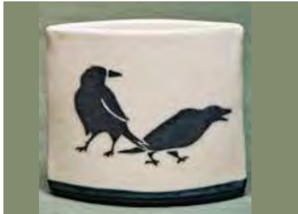
9240 Vase/Holder, 4.5 x 2.5 x 4.5"