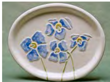
5106 Plate, 10.25 x 8.5 x .75"