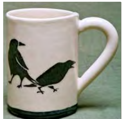
5120 Mug, 4.5 x 3 x 4.5"