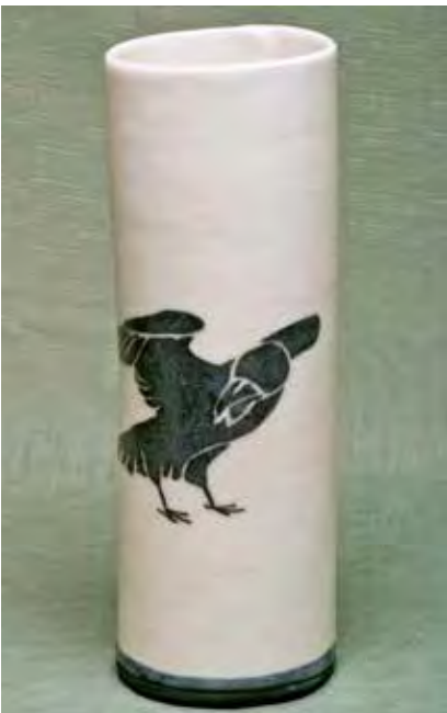
4050 Vase 3.5 x 9"

Noisy and gregarious, crows are a symbol of good luck!