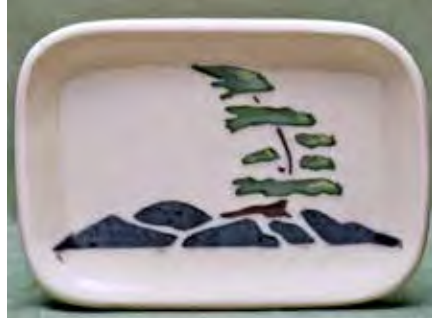
9220 Soap Dish, 3.5 x 5"