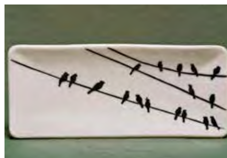
5535 Rectangle dish, 10 x 4"