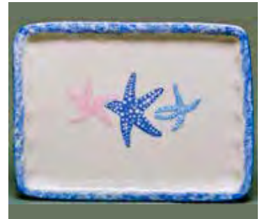
5451 Plate, 8.25 x 11 x .5"