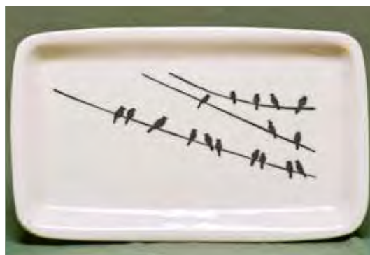
5449 Plate, 14 x 8 x 1"