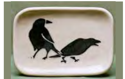
9220 Soap Dish, 3.5 x 5"