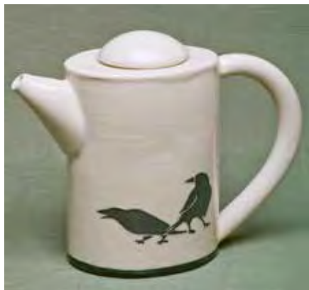
5185 Teapot, 9 X 3 X 9"