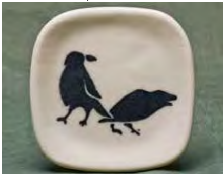
5534 Tea Bag Holder, 3.5 x 3.5"