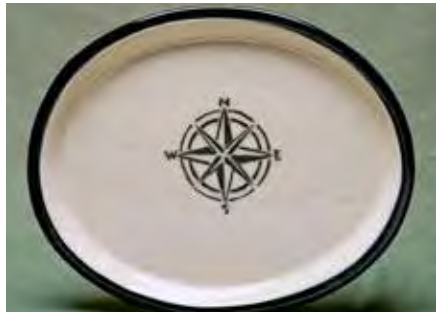
5106 Plate, 10.25 x 8.5 x .75"