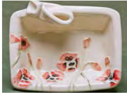
5463 Plate 6.25 x 4.75 x 1.75", plate knife