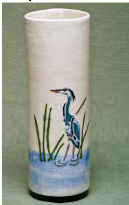
4050 Vase 3.5 x 9"