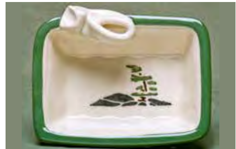
5463 Pate, 6.25 x 4.75 x 1.75", pate knife