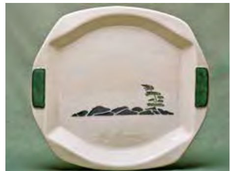
5469 Serving Tray, 14.5 x 13 x .75"