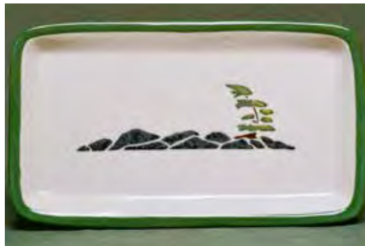
5449 Plate, 14 x 8 x 1"