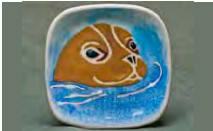
5534 Tea Bag Holder, 3.5 x 3.5"