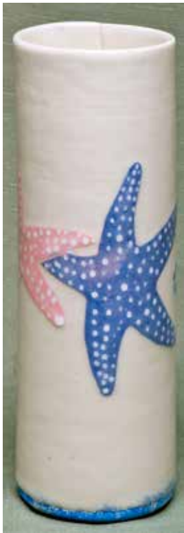
4050 Vase, 3.5 x 9"