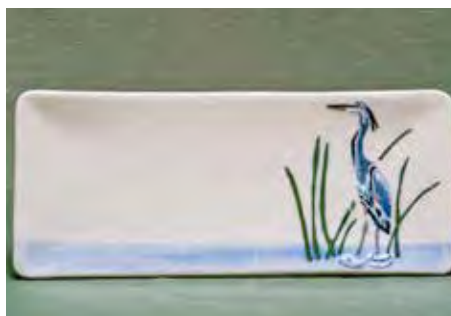
5535 Rectangle dish, 10 x 4"