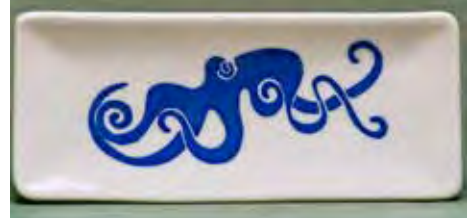
5535 Rectangle dish, 10 x 4"