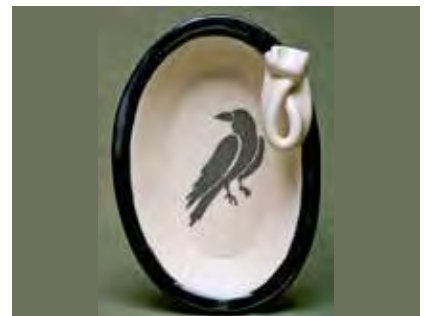
5461 Pate, 7.25 x 4.5 x 1.5", pate knife