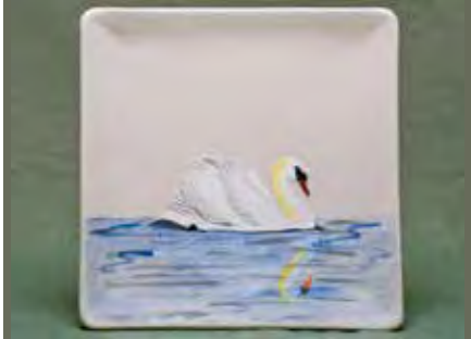
5530 Dinner Plate, 8 x 8