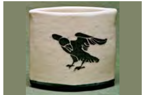
9240 Vase/Holder, 4.5 x 2.5 x 4.5"