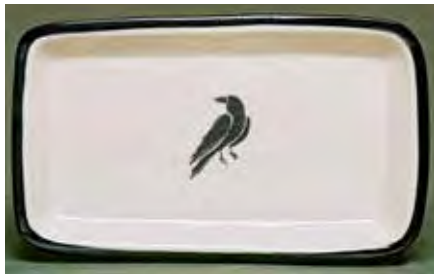
5449 Plate, 14 x 8 x 1"