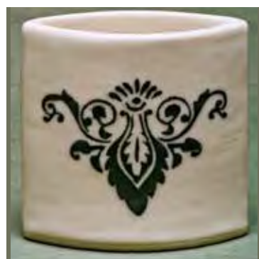
9240 Vase/Holder, 4.5 x 2.5 x 4.5"