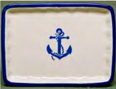
5451 Plate, 8.25 x 11 x .5"