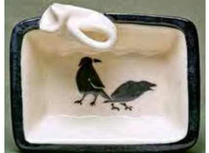
5463 Pate, 6.25 x 4.75 x 1.75", pate knife