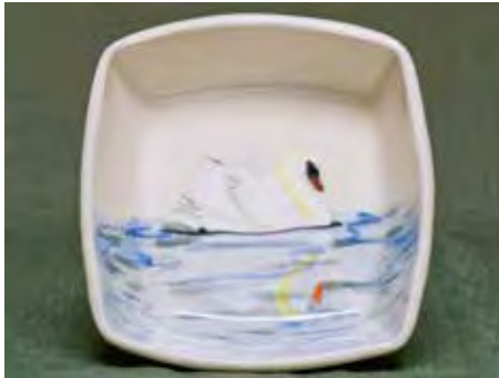
5533 Bowl, Rimless, 5.5 x 5.5 x 1.75"