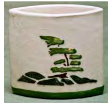
9240 Vase/Holder, 4.5 x 2.5 x 4.5"