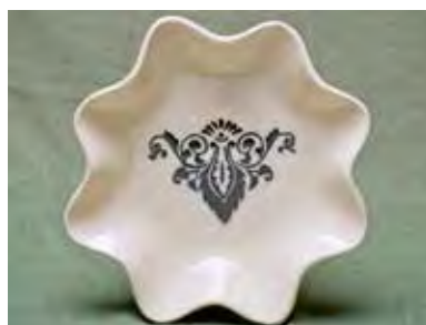
5517 Fluted Bowl, 7.75 x 7.75 x 1"