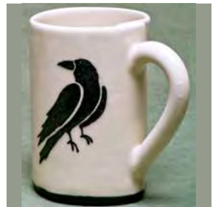
5120 Mug, 4.5 x 3 x 4.5"