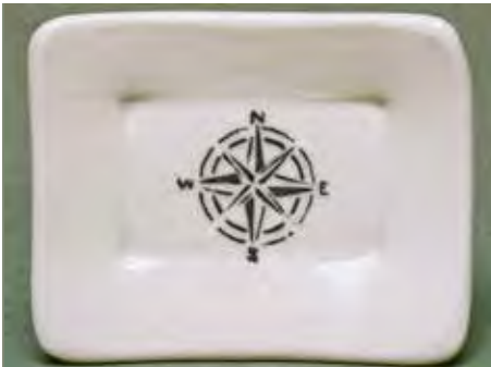
5067 Oval Baker, 8.5 x 4.5 x .5"