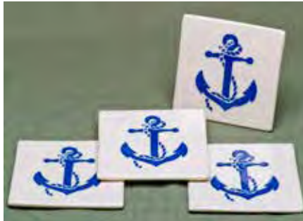
9410 Coaster Set, 4 x 4"