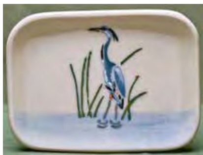
9220 Soap Dish, 3.5 x 5"