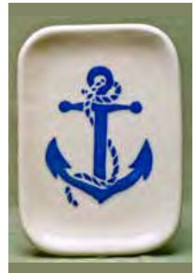
9220 Soap Dish, 3.5 x 5"