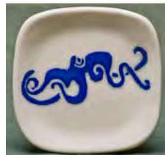
5534 Tea Bag Holder, 3.5 x 3.5"