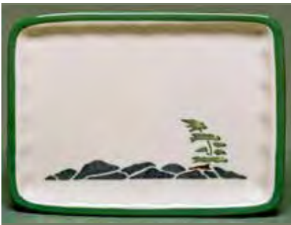
5451 Plate, 8.25 x 11 x .5"