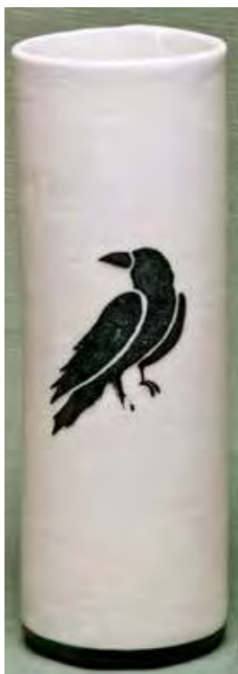
4050 Vase, 3.5 x 9"

The sleek silhouette of the common crow makes a stunning image when captured on nature's clay.