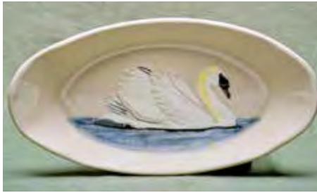
5067 Oval Baker, 8.5 x 4.5 x .5"