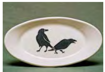
5067 Oval Baker, 8.5 x 4.5 x .5"

Easy-going, industrious, couple of crows to delight your customers!