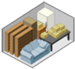
10x15 Storage Unit (150 square feet)

These units are commonly used to store things that need to be moved for minor home renovations, to make room in small retail stores, or to get some excess things out of one and two-bedroom apartments.