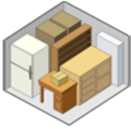
10x10 Storage Unit (100 square feet)

10 ft × 10 ft (3.0 m × 3.0 m), about the size of a child's bedroom (as of 2015, 10x10's are the most common storage unit size, making up 16% of the distribution in the U.S.)