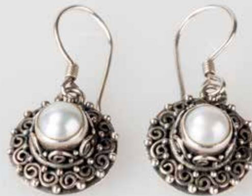
Price: $90 - #2353