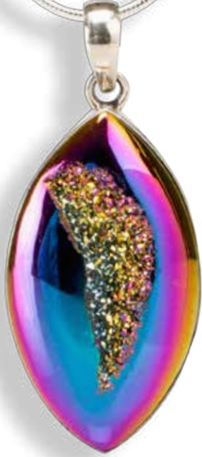
Balance Collection - 925 Sterling Silver, Purple Druzi Agate Pendant