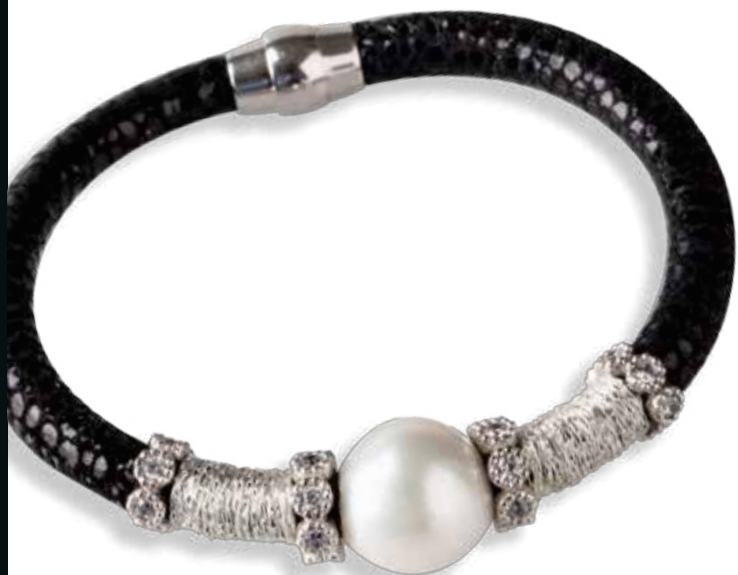
Price: $199 - #2371