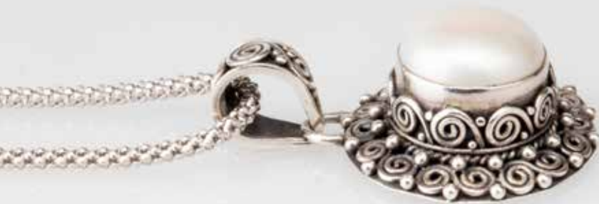
Price: $89 - #2350