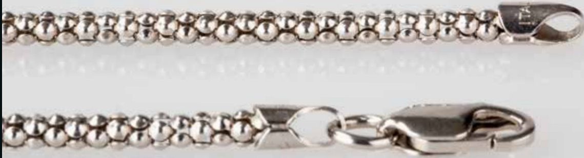
925 Sterling Silver Italian Beaded Chain