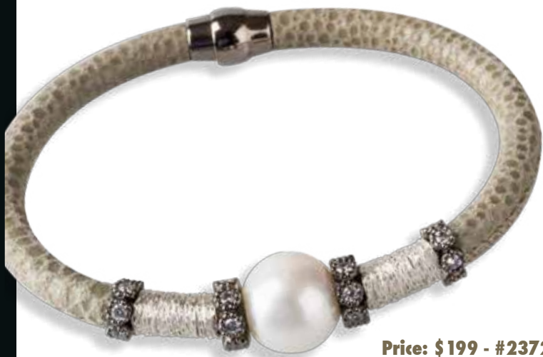
Price: $199 - #2372