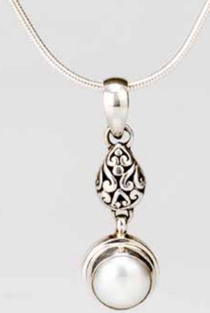
Price: $75 - #2351