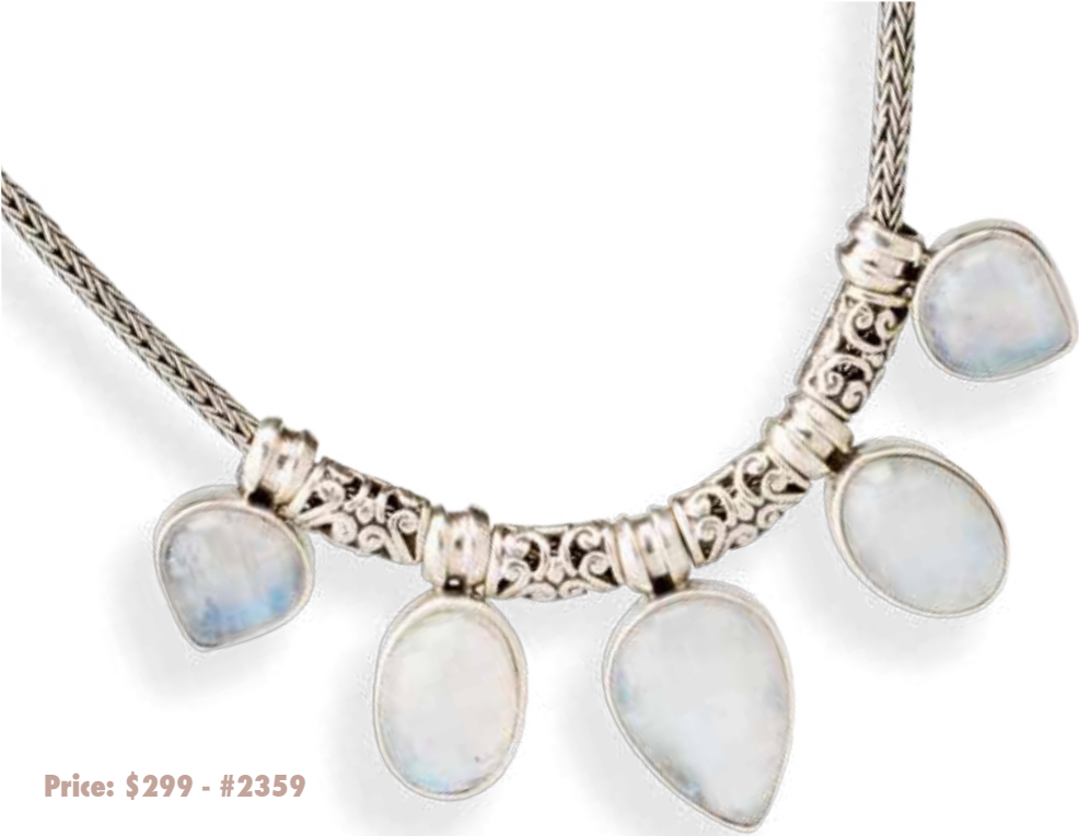
Price: $299 - #2359