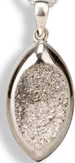
Balance Collection - 925 Sterling Silver, Silver Druzi Agate Pendant