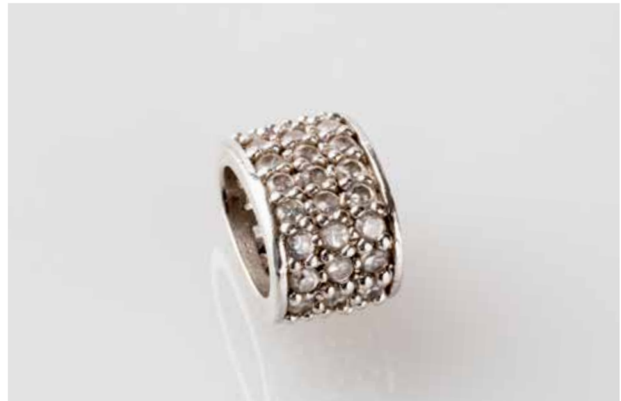
925 Sterling Silver Chain Charm