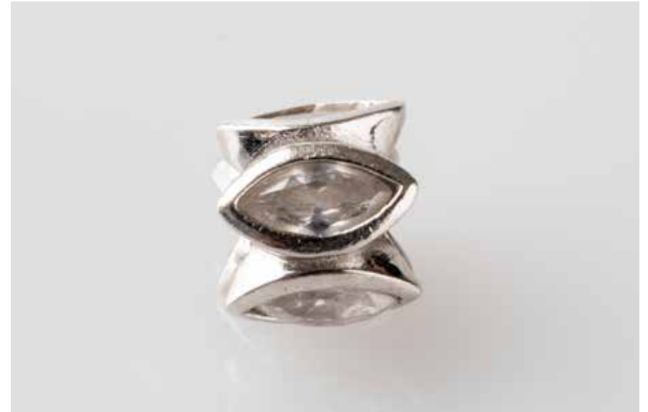
925 Sterling Silver White Charm