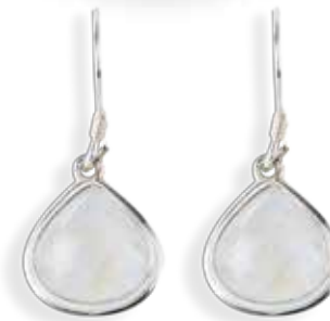
Price: $165 - #2357