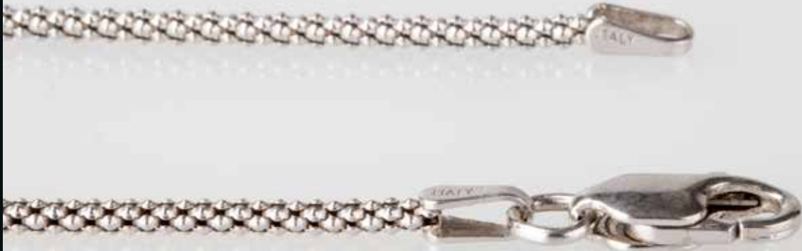
925 Sterling Silver Italian Vintage Chain