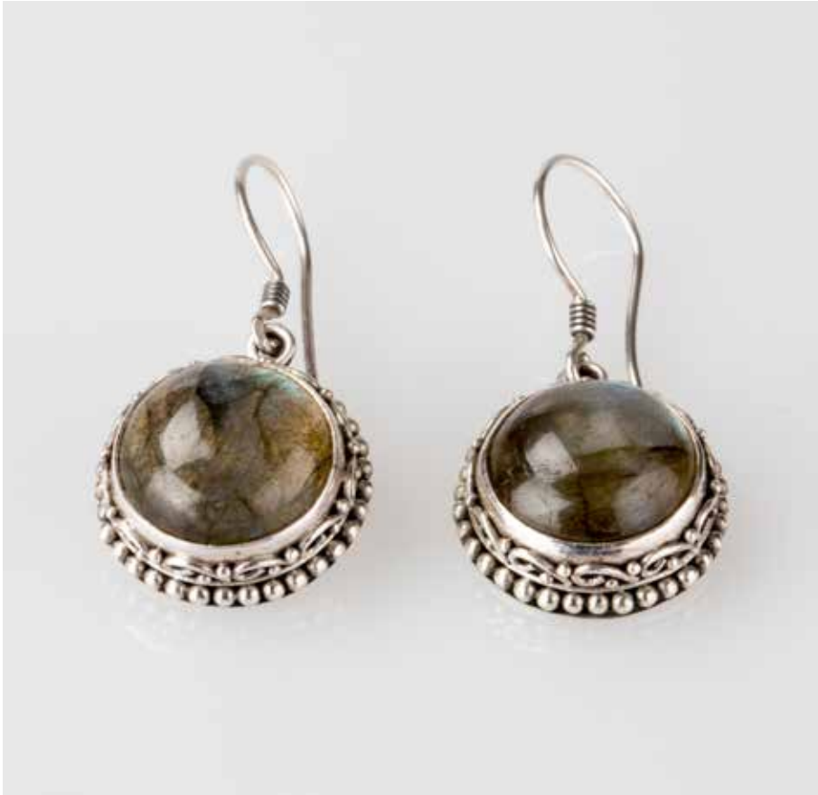
Price: $75 - #2390