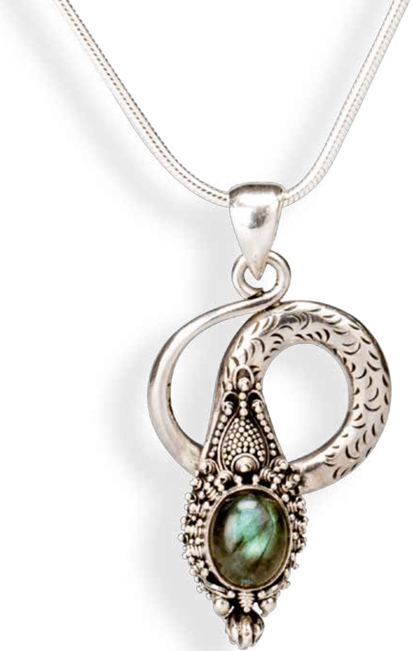
925 sterling silver, Labradorite Dragon Pendant Price: $99 - #2380

Success, Balance, Wisdom, Influence the solar plexus and third eye chakras