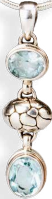
Price : $75 - #2366