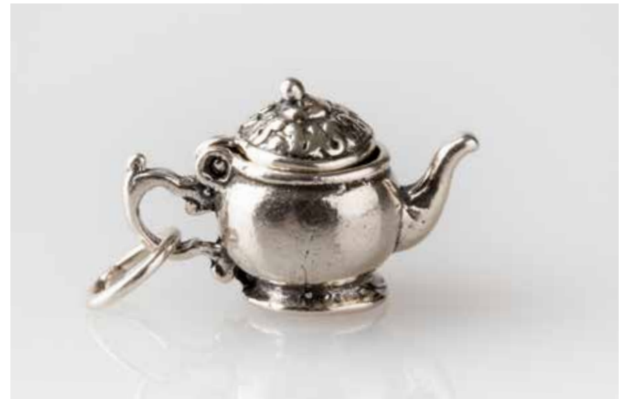
925 Sterling Silver Round Teapot Charm