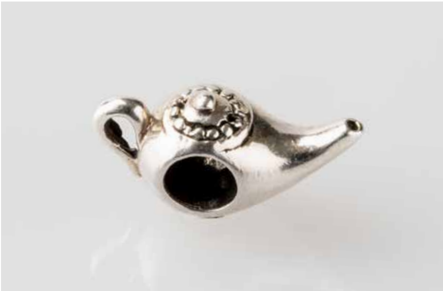
925 Sterling Silver Teapot Charm