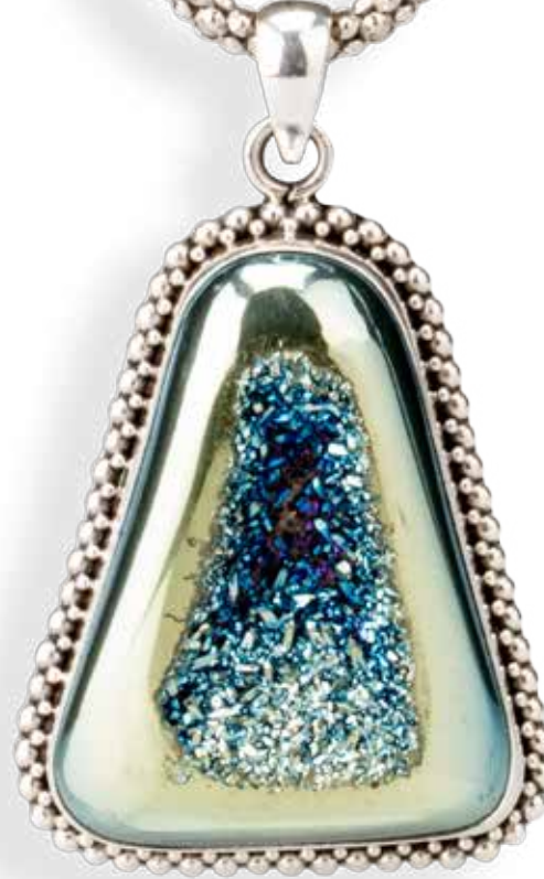
Balance Collection - 925 Sterling Silver, Green Druzi Agate Pendant