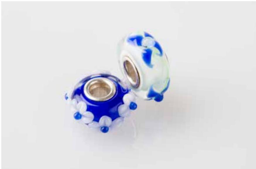
Blue Flower Glass Charm