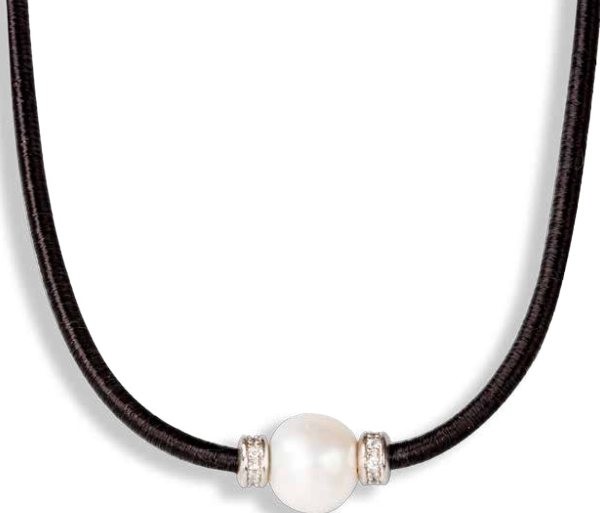
Price: $229 - #2370

The Luca Lorenzini jewelry line is a mixture of innovative and classic materials made into unique creations by their design. All the pieces by Luca Lorenzini are 100% made in Italy, and are designed and produced by hand.