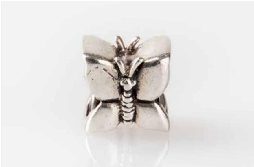
925 Sterling Silver Butterfly Charm