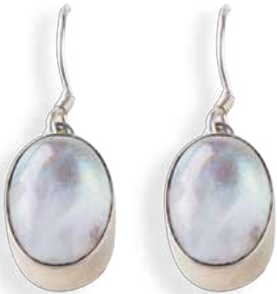
Price: $92 - #2360