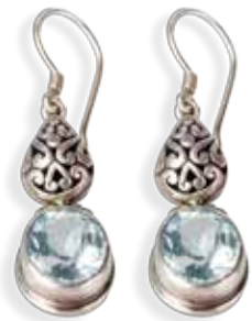
Price: $60 - #2365