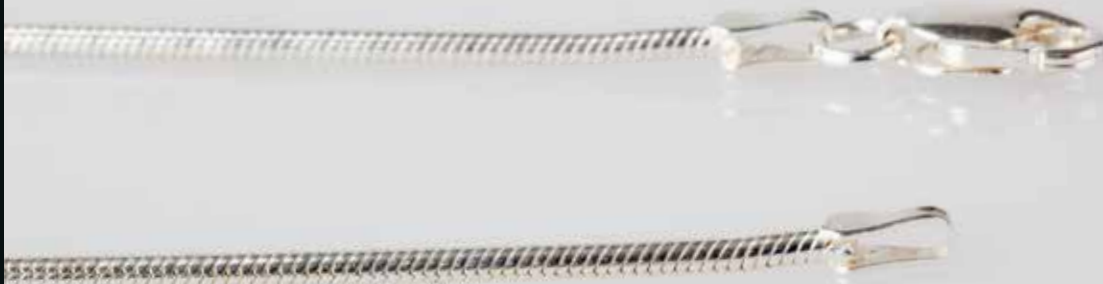
925 Sterling Silver Italian Snake Chain