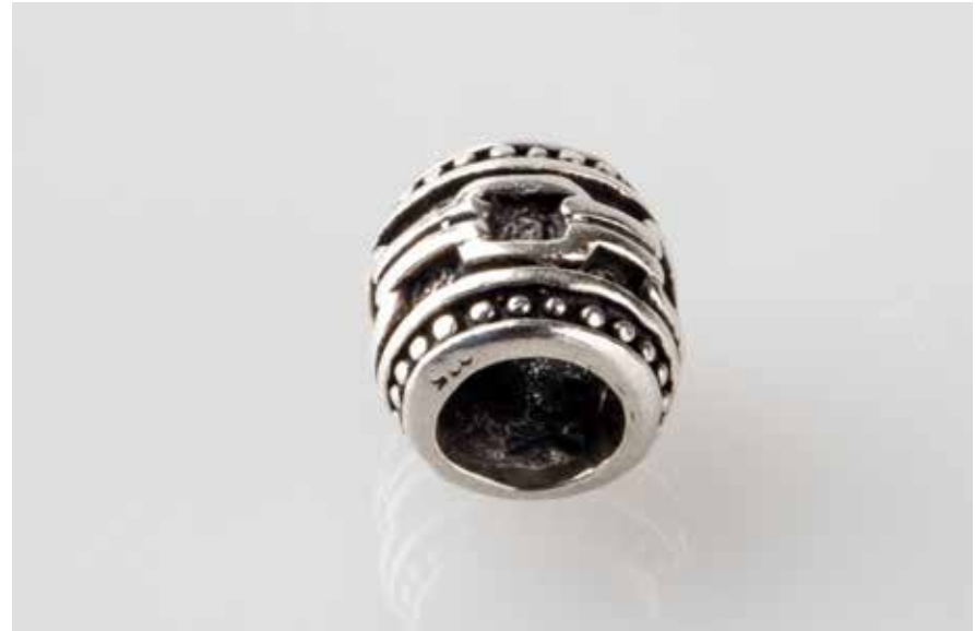
925 Sterling Silver Link Charm