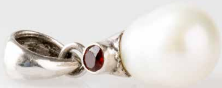
Price: $65 - #2352