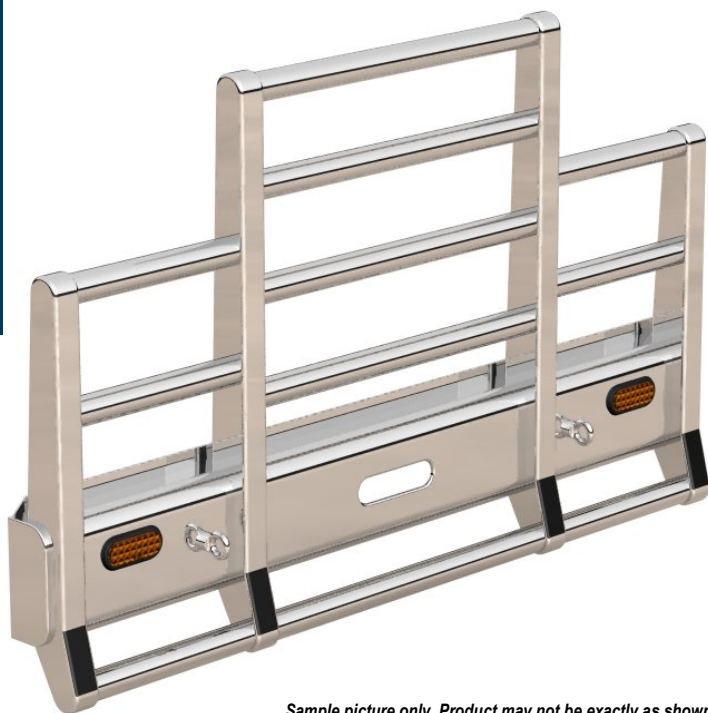
Sample picture only. Product may not be exactly as shown .